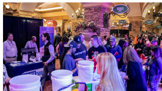
The packed exhibit hall featured 43 exhibitors.